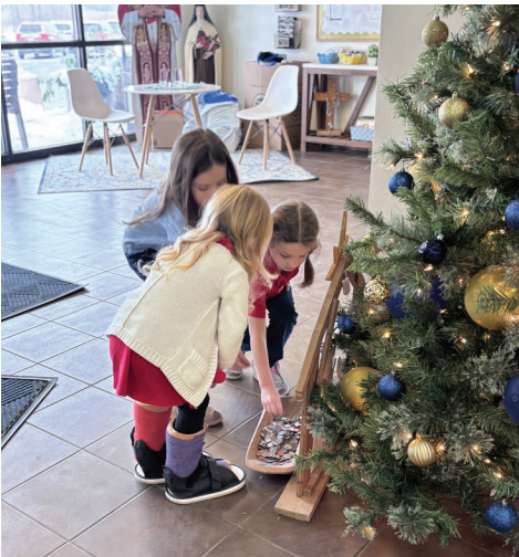
Holy Cross students add their coins to the collection basket.

The third project focused on elderly residents. In the "Adopt a Resident" program at Anna's House, students in grades 5-8 collected, wrapped, and delivered gifts before Christmas break. They also played bingo and sang Christmas songs with the residents. Meanwhile, younger students visited Angel's Touch Assisted Living in De Pere to share holiday cheer. This project offered students a special learning experience while bringing joy to their newfound acquaintances and serving as a tangible Corporal Work of Mercy.