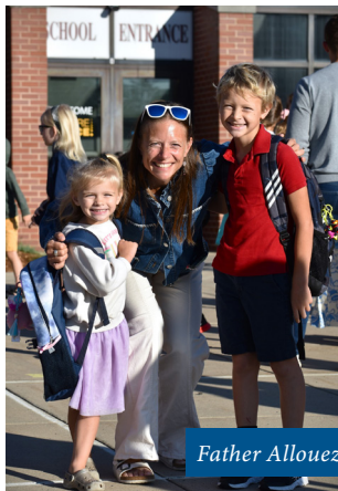
Father Allouez Catholic School