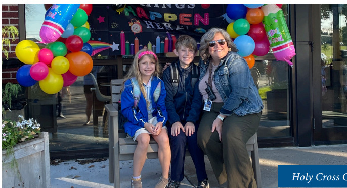
Holy Cross Catholic School