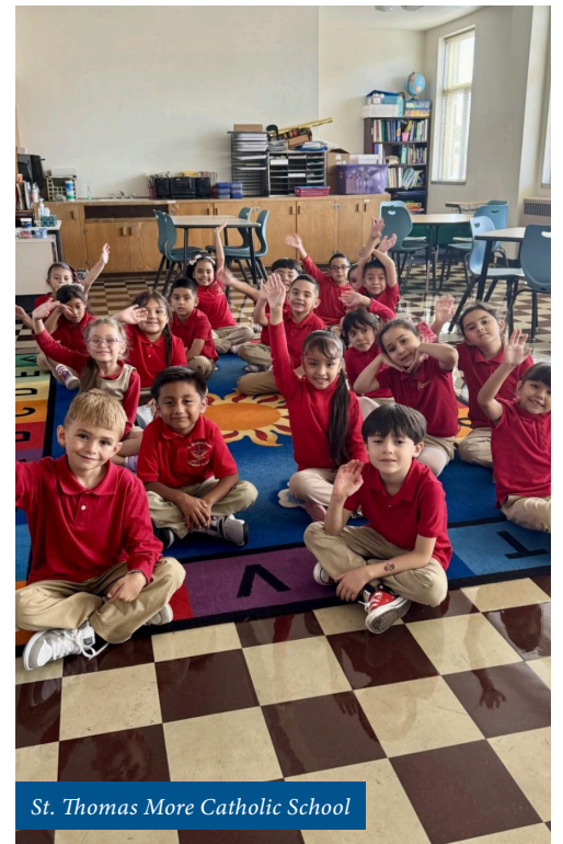
St. Thomas More Catholic School