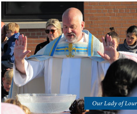
Our Lady of Lourdes Catholic School

he enjoys reading, carpentry, golf, and attending sporting events and concerts but for now, his main focus is bolstering Catholic education at St. John Paul II Classical School and Chesterton Academy.