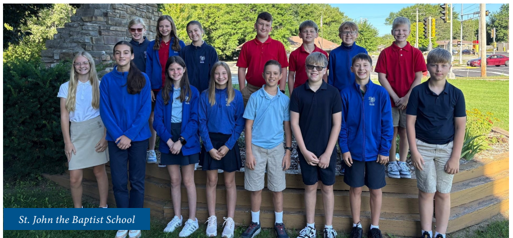
St. John the Baptist School