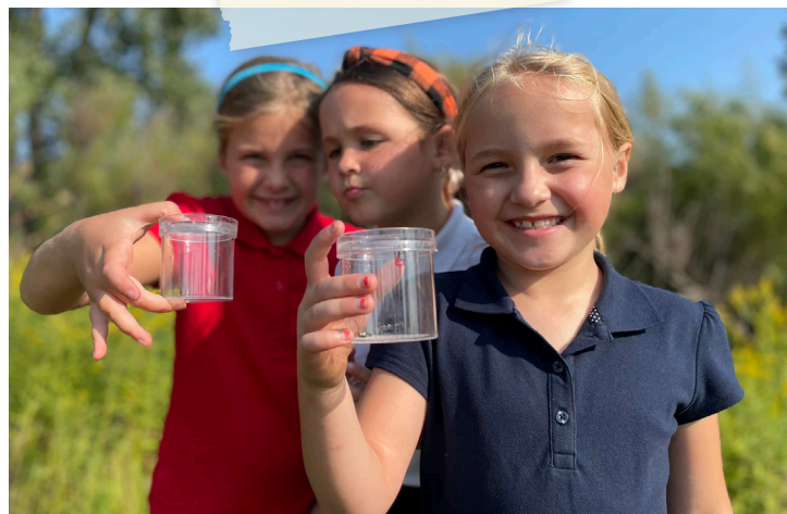
Holy Cross Catholic School Works on a STEM Unit in Nature