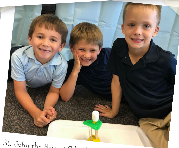
St. John the Baptist School First Grade Participates in a STEM Marshmallow Challenge