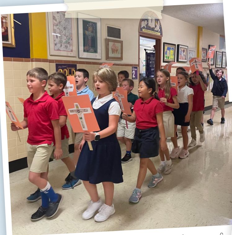
Holy Family Catholic School Celebrates the Feast of the Exaltation of the Holy Cross