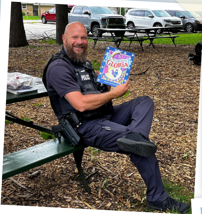
St. Bernard Catholic School Hosted Guest Readers for Their Storytime in the Park Series