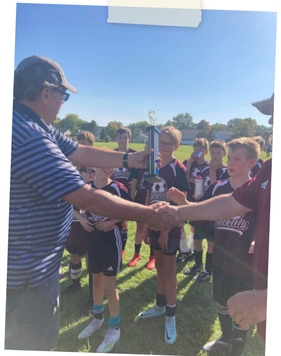
Our Lady of Lourdes Catholic School Celebrates a Soccer Win