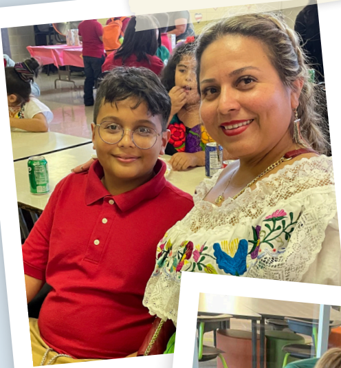
Hispanic Heritage Month Celebration at St. Thomas More Catholic School!