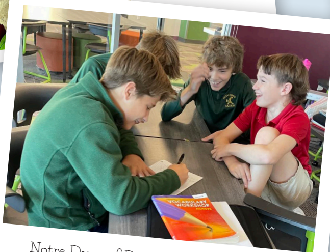
Notre Dame of De Pere Students Practice Creative Writing