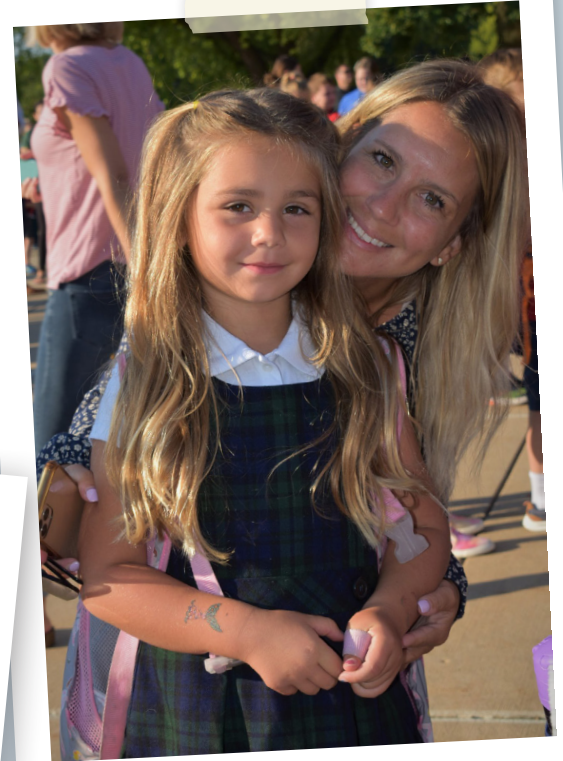
Father Allouez Catholic School Kicks Off the School Year