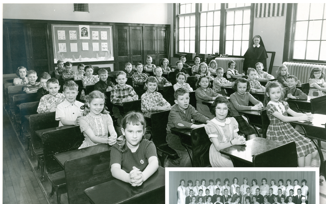
St. Francis Xavier in De Pere