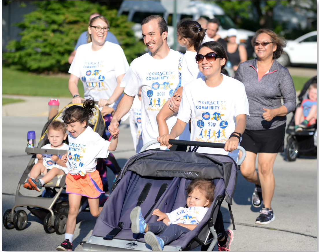
All nine GRACE schools and multiple GRACE parishes were represented at the inaugural GRACE Community 5K Wellness Fun Run/Walk.