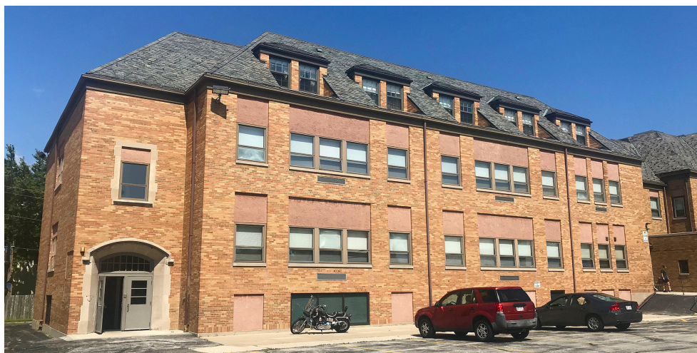
St. John Paul II Classical School's new home at the St. Philip the Apostle campus features dedicated rooms for nature study, art and music, as well as a library, atrium and room for student support services.