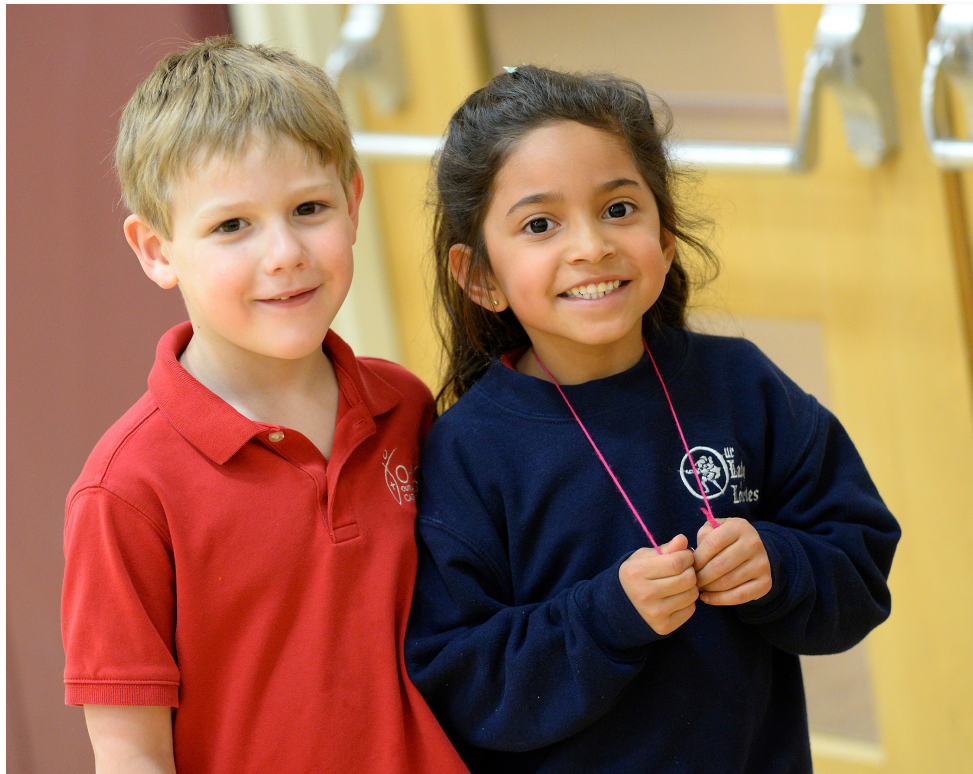
One of the goals this year at Our Lady of Lourdes Catholic School is to help students form stronger, healthier relationships with each other.